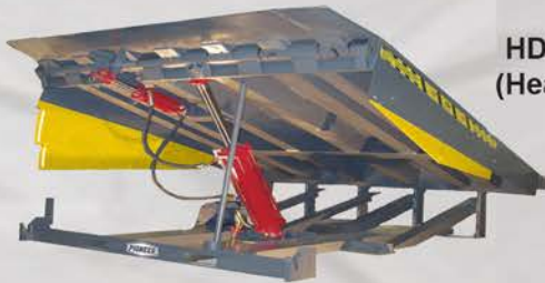
HDH Series (Heavy Duty)

Durable PIONEER Levelers are available in virtually every length, width, and capacity configuration.