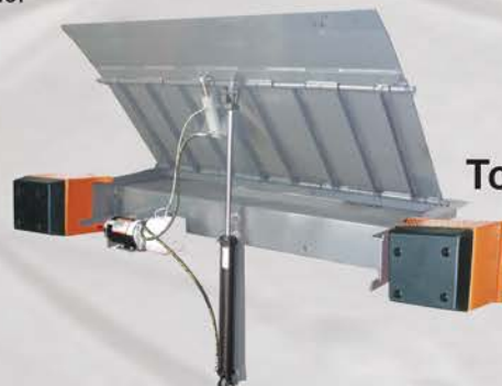
Hydraulic Top-of-Dock Levelers

Versatile Hydraulic Top-of-Dock Levelers are perfect for retrofit situations where there is not an existing pit, and working range requirements exceed those provided by Edge-of-Dock Levelers.