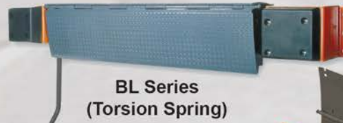
BL Series (Torsion Spring)