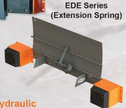
EDE Series (Extension Spring)