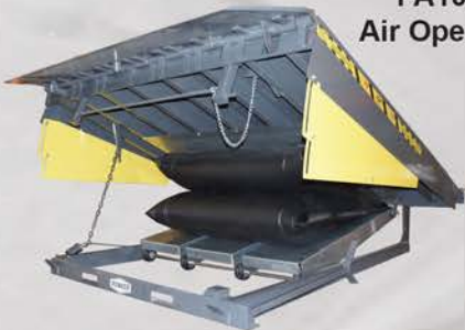
PA1000 Air Operated