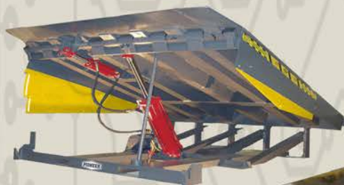
HDH Series (Heavy Duty)

* SMART+™ Versa Panel picture shown with optional Emergency Stop.