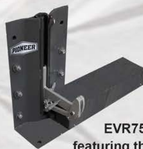
EVR750 Series featuring the ForceFlex Hook